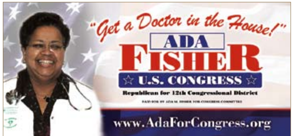
In her quest for a seat in the U.S. Congress, Fisher calls for an affordable healthcare system with responsible tort reform, less expensive drugs and an emphasis on preventive medicine.

And not surprisingly, her platform, which emphasizes job growth and national security, also includes plans for serious healthcare reform. Paramount among them is fashioning a more